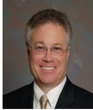
Donald Canaday Cardiology