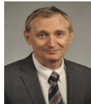
Val Lev Cardiology